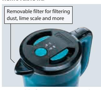
Removable for easy water supply and cleaning